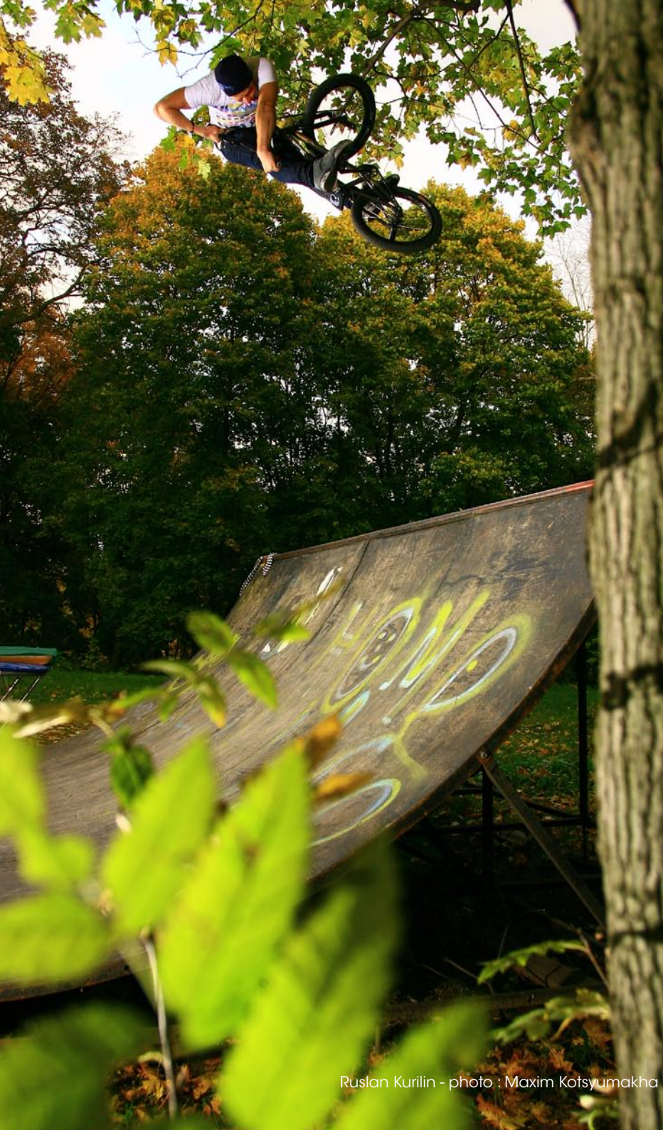
Ruslan Kurilin