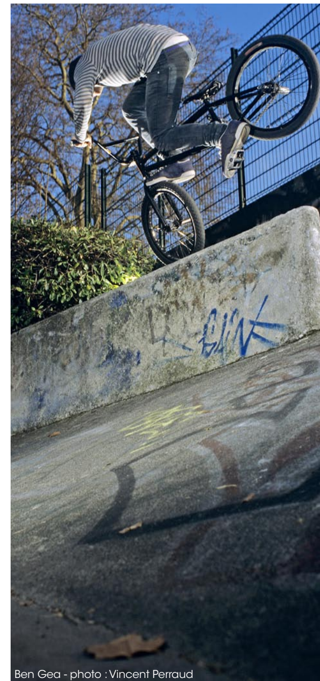
Ben Gea